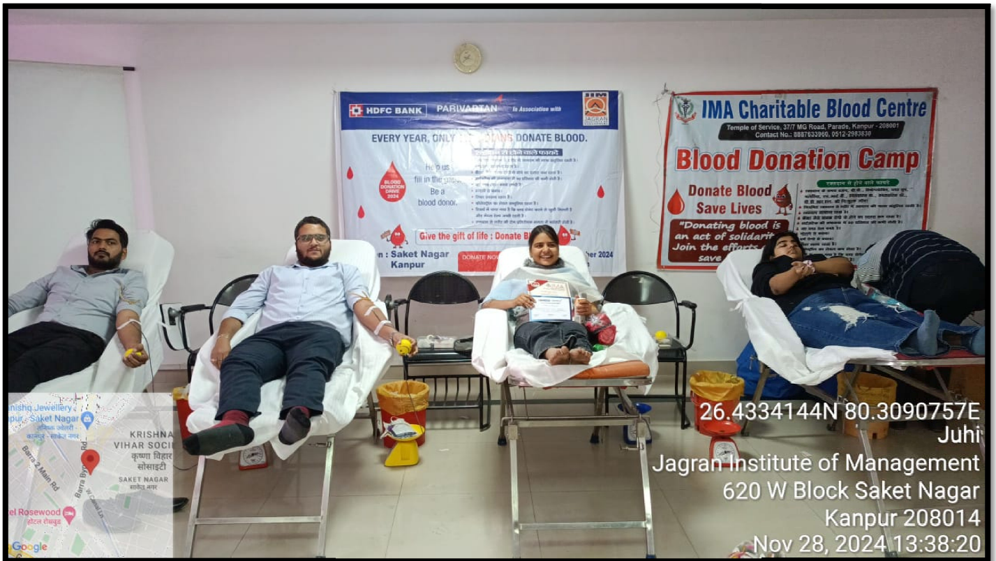
Students participation@Blood Donnation