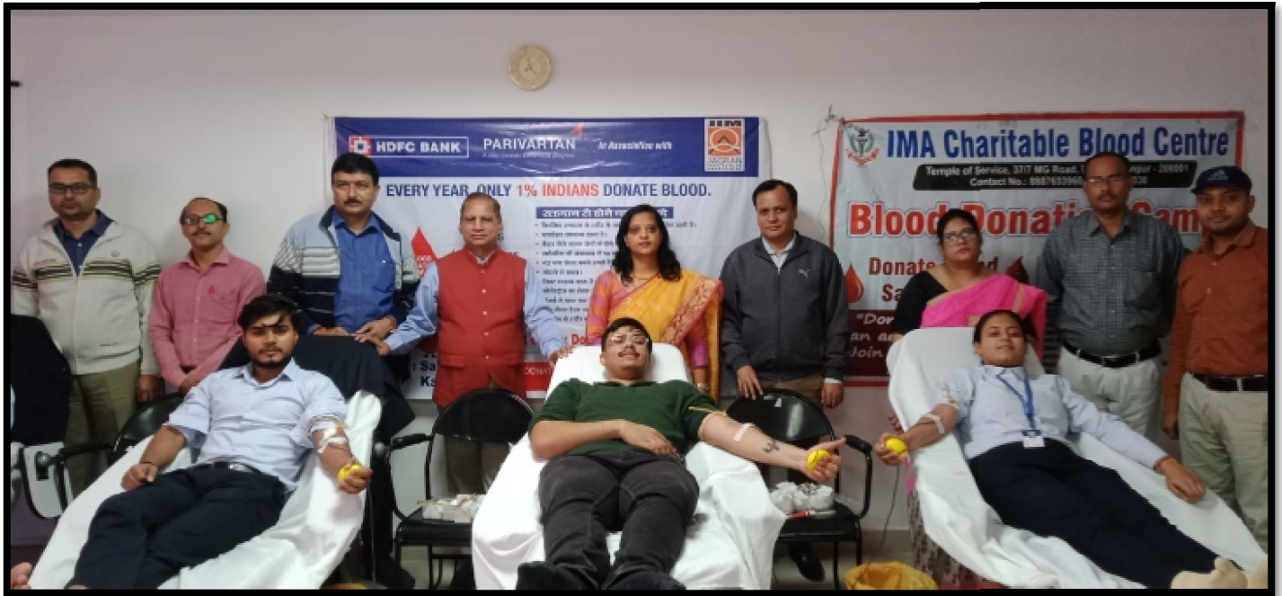
Inaurnal Session@Blood Donnation