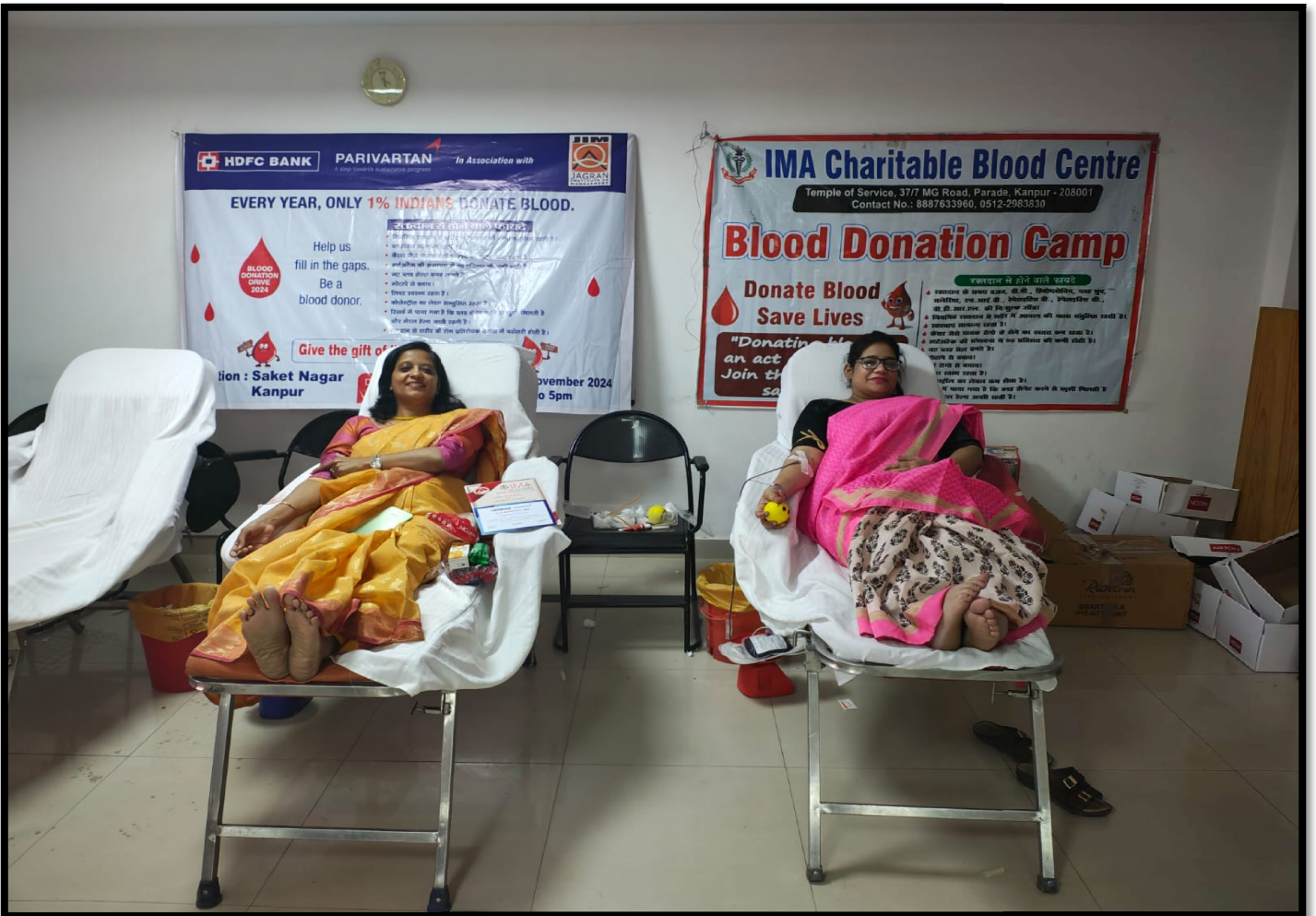
Director and Faculty participation@Blood Donation