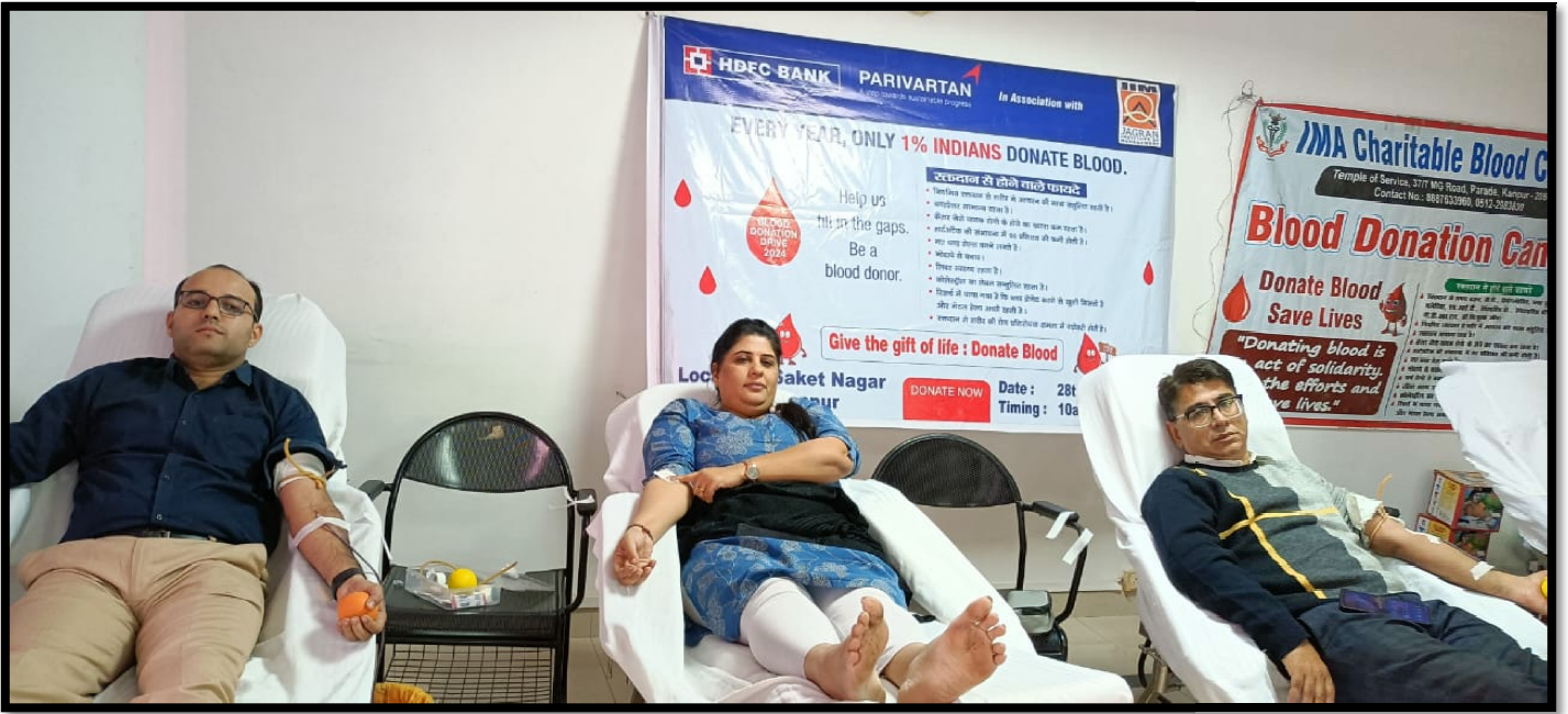
Faculty and Staff participation@Blood Donation