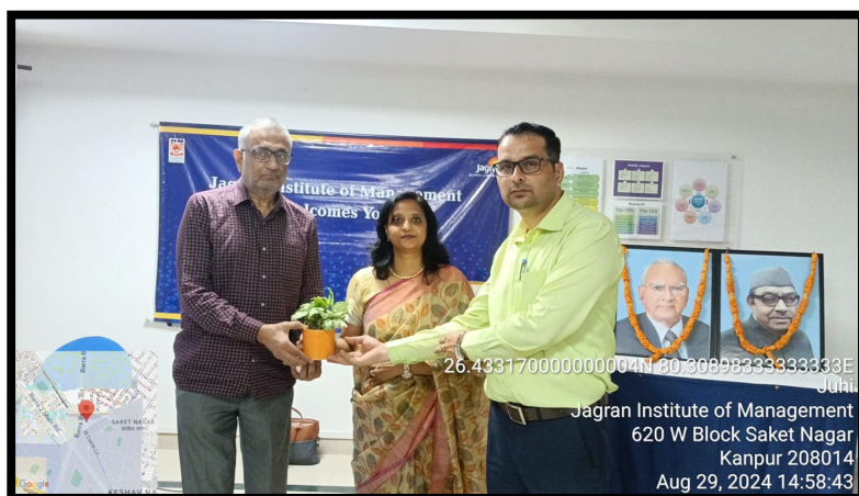
Felicitation of the Guest Speaker